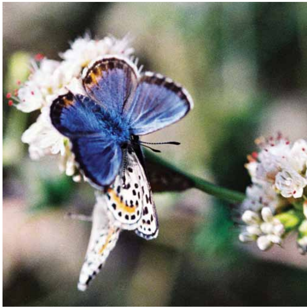
The El Segundo Blue Butterfly, which became the first insect to be listed as a federal endangered species, is sometimes referred to as an umbrella species because by protecting the butterfly their habitat and the other species that live in it are also being protected.